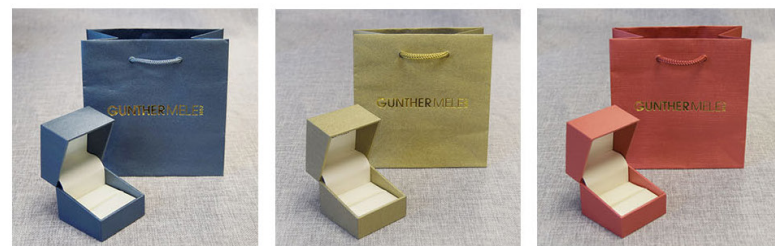
Shown in Celestial Blue

Available in 16 colors in a selection of 4 luxurious textured papers.